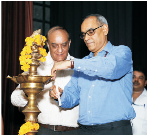
Dr TD Dhariyal, Commissioner for Persons with Disabilities inaugurating North Zone Regional Abilympics