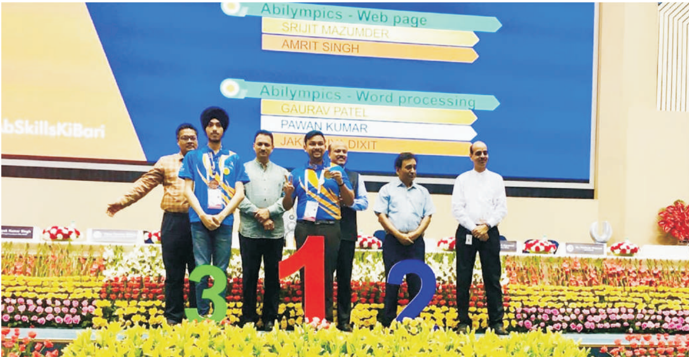
Presenting the winners