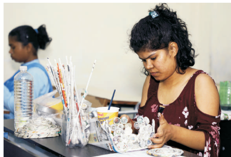
Regional Abilympics Participants in Waste Reuse sub-category of Crafts