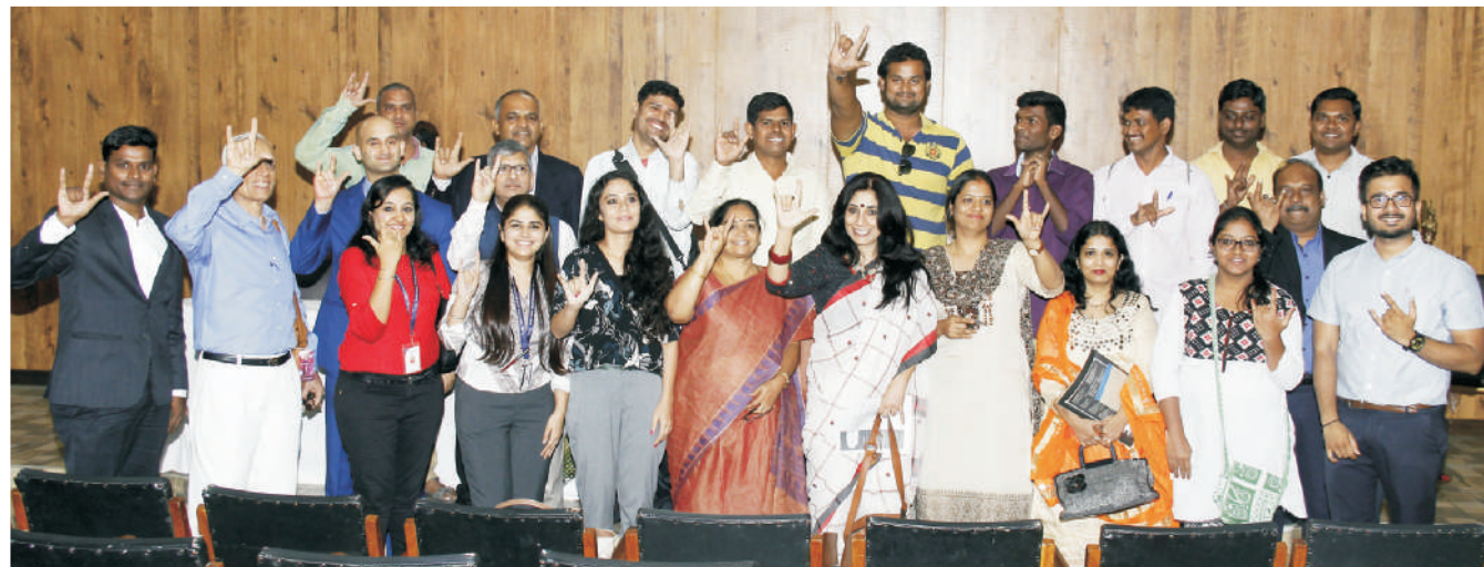
Corporate Leaders during South Zone regional Conference