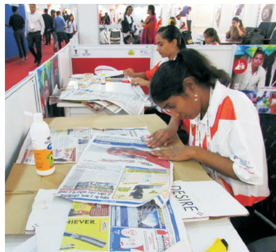
National Abilympics Participants in Painting