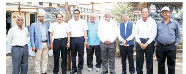
Sarthak National and Pune Advisory Board Members during West Zone Regional Abilympics 2018