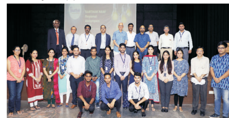
Team Sarthak and NAAI during North Zone Regional Abilympic 2018