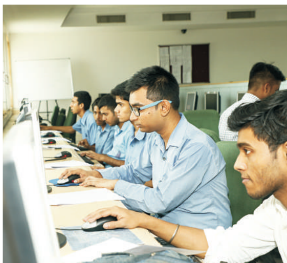
Regional Abilympics Participants in IT Category