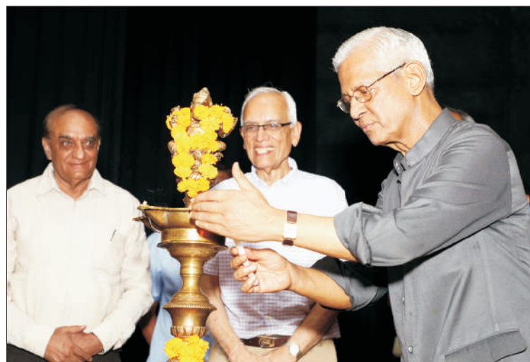
Padma Bhushan Dr MB Athreya lighting the lamp during North Zone Regional Abilympics